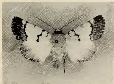
Fig. 5. Dichagyris imperator (A. B.-H.) Libya, Gharian, Wadi El Hira, 6.V.1983 leg. U. SENECA, coll. M. Fibiger.